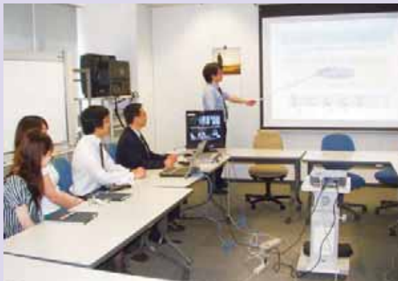
CSR Procurement Promotion Workshop

The Group regularly organizes CSR procurement promotion workshops to proactively advance the creation and development of technologies and services effective in improving the environment, starting at the stage of procuring fundamental raw materials.