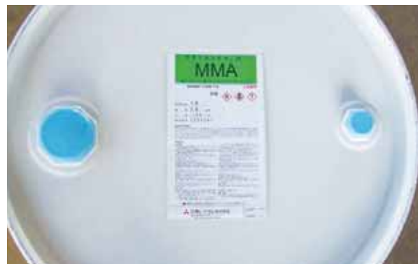
A GHS compliance label is affixed to the top of a drum containing MMA monomers.

In December 2007, the stopgap measures under the Industrial Safety and Health Act came to an end. Mitsubishi Rayon achieved compliance with the Globally Harmonized System of Classification and Labelling of Chemicals (GHS) ahead of schedule. Since last year, GHS legislation has come into effect in an increasing number of Asian markets, such as Taiwan in December 2008 and China in February 2009. In light of this environment, the Group is suitably responding via contact with local consulting offices and law firms. In the future, we will work to ensure GHS compliance in Europe, South Korea and elsewhere.